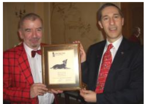
Certificate from Hearing Dogs for Guy our first Dog

My thanks on their behalf, particularly as much more has been collected I know and do keep sending it in.