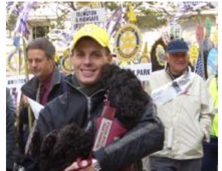
Rotary and Hearing Dogs at the Lord Mayor's Show