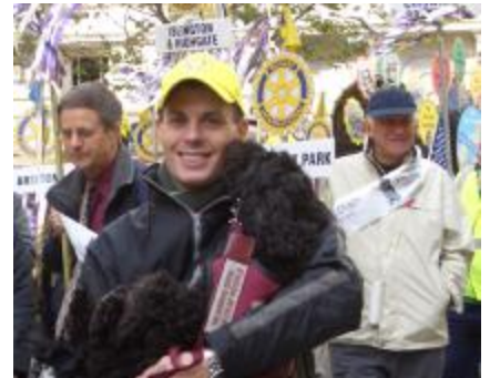
Rotary and Hearing Dogs at the Lord Mayor's Show