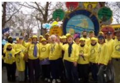
Ready for the New Year's Day Parade

ShelterBox report that over 7000 boxes have been dispatched to the same region, with aid continuing in this region. This is in addition to the 13000 boxes sent to tsunami affected areas and 1300 to areas of America affected by Hurricane Katrina.