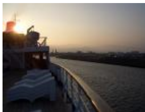
Sunset aboard the MV Funchal, for the District 1240 Conference.